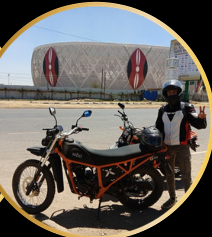
Talanta Sports stop

Rental Options: incase you want to upgrade the bike allocated during the tour.