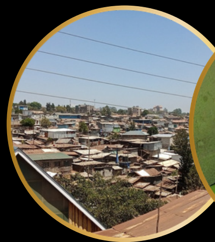
Kibera View Point

It's understanding Nairobi from the inside.