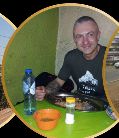
Kibera Lunch Stop